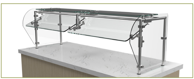
To meet NSF guidelines, end panels are included on all BSI quotations unless specifically excluded. (See End Panel Page for More Details.)

Self Serve w/Top Shelf, U-Shaped End Posts w/ Shortened Center Post